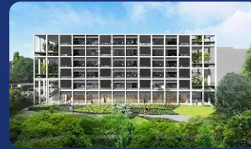
Kajima Lab for Global Engineering, Architecture & Real Estate: The GEAR