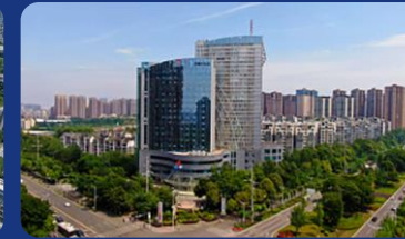
China 19th Metallurgical Corporation Sichuan Branch