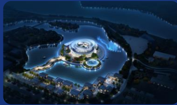
Waterfront Reception Hall Project