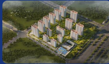
Shiguangyu Residential Project