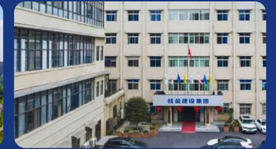
China National Nuclear Corporation Jinhua Construction Group