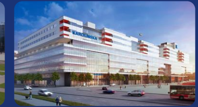
New Karolinska Solna