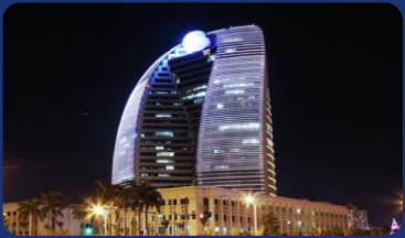
Beijing Construction Engineering Group – "Rongtong Zhixin" Group-Level Digital Transformation