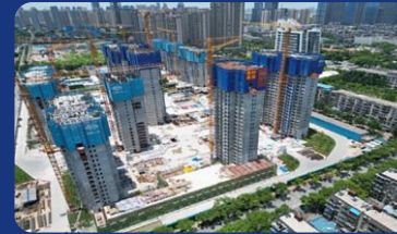
China First Metallurgical Group Construction Engineering Branch