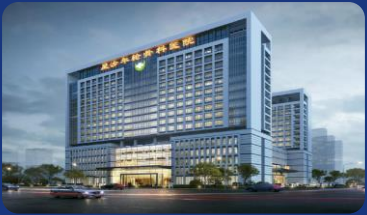
China State Construction Engineering Corporation Fifth Bureau Design Institute