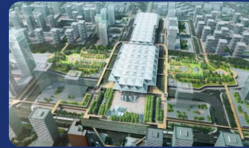
China Railway Construction Southwest – Chengdu North Railway Station Tower Cluster Project "Secure, Efficient, Traceable, and Lightweight Maintenance"