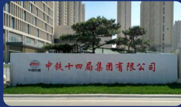
China Railway 14th Bureau Group "Integrated Payroll, Business, and Finance System" Project